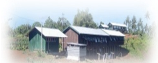
John Bosco Senior Secondary School Nila

Students must be fully committed and concentrate to their studies. This needs motivation and enthusiasm. Parents must be committed to providing school fees. And let's give up laziness.