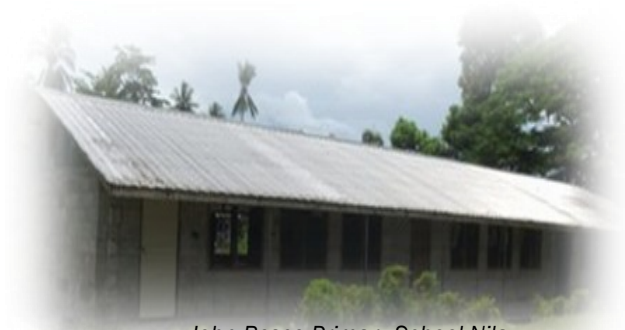
John Bosco Primary School Nila

I heard positive stories about the schools run by our mission in 60's—70's. Now we are gearing up for that establishment so let's have our students' guide by school rules, which required disciplinary processes.