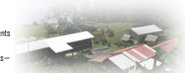
John Bosco Junior Secondary School Tuha